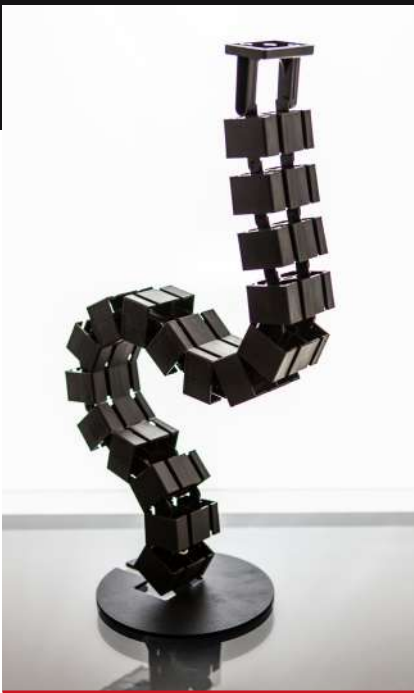
VERTEBRA "cable manager"