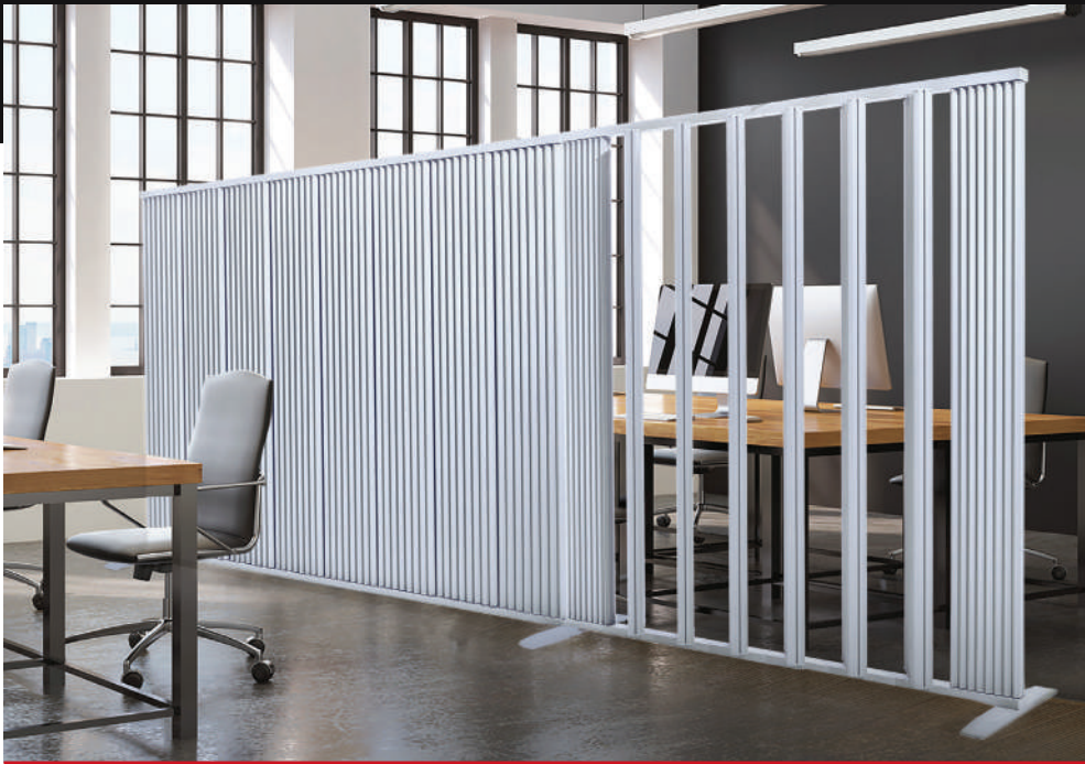
MODULAR EXPANDABLE PARTITION PANEL