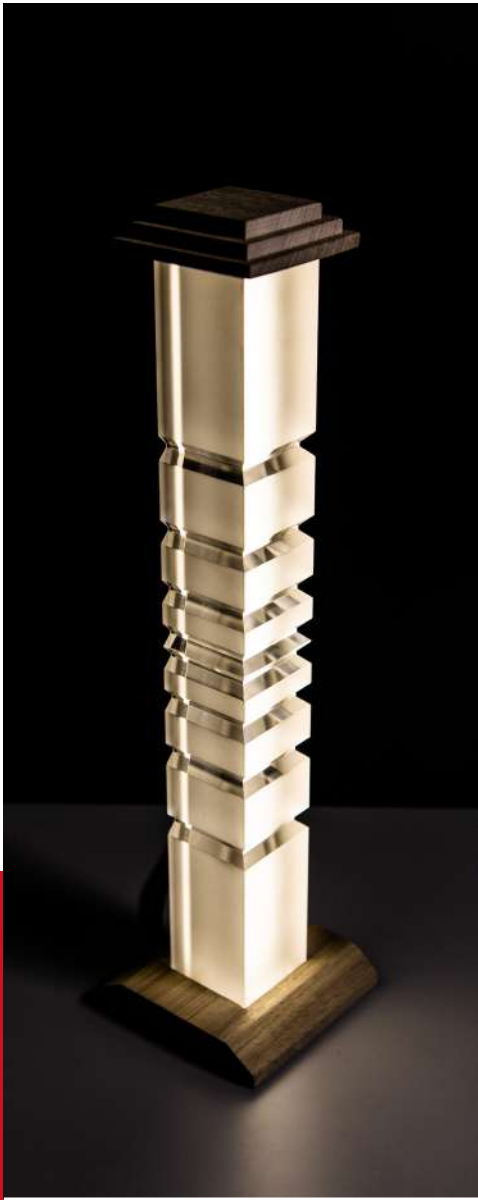
DIAMOND CNC MILLING